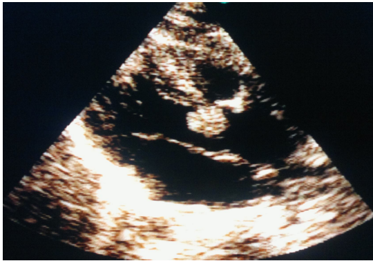
Figure 1: LVOT Tumor in LAX 2D echocardiography about (size=11x12mm)

Echocardiographic examination revealed a large lobulated hyperechogenic mass within the intraventricular septum extending into the left ventricular outflow tract (LVOT) and causing significant flow obstruction (figures 1& 2).