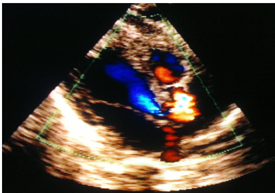
Figure 2: LVOT Tumor in LAX colerechocardiography (PG=55mmHg)

The functional diameter of the outflow tract was about 11×12 mm (fig 3) and the pressure gradient reached 55 mmHg.