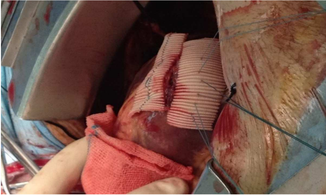
Figure 3. Repair of left ventricular rupture with Dacron patch