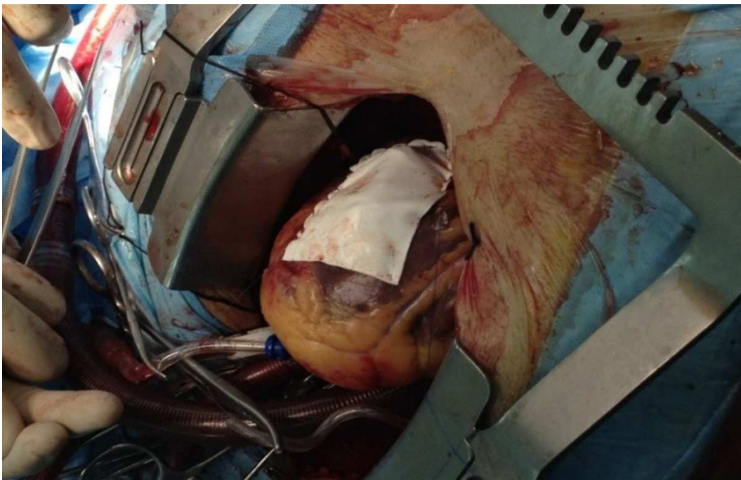
Figure 4. Reinforcement of left ventricular rupture after repair with Gore-Tex patch

Rupture of the ventricular free wall and cardiogenic shock are the major causes of death following AMI, contributing to 66% of deaths due to first AMI. 6